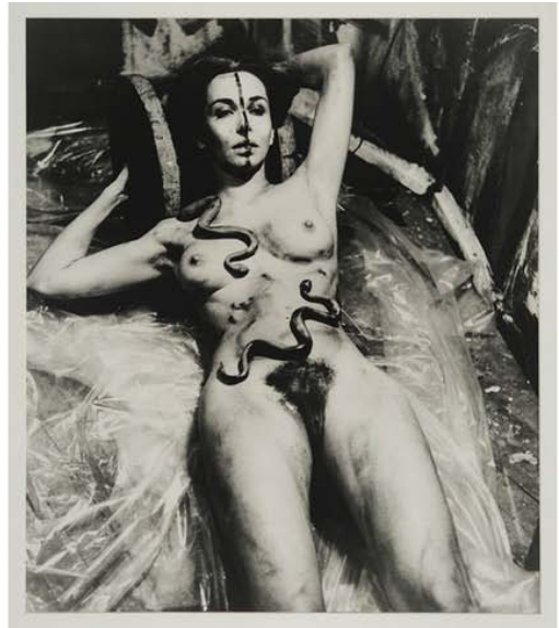
Left: Alice Neel, Nadya Nude , 1933. Right: Carolee Schneemann, Eye Body (From 36 Transformative Actions for Camera ), 1963/1985.

Semmel remembers Cantor and Cronin as young students. “Ellen looked like a punk street kid, and Pattie like a girl just out of a school uniform,” she says. “But they were both hard-nosed and realistic about the difficulties of being taken seriously, and entering the art world.”